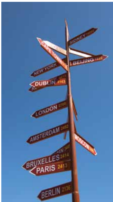
Cross-border compatibility, and therefore interoperability, is a complex issue

The implementation of distance-based charges also allows for the redistribution of the burden and allocation of funds compared with current fuel taxation policy that is not location-specific. This would enable usage fees collected in specific areas to be allocated to the same areas if needed. Hypothecation may not always be appropriate but at least it would be more feasible with distance-based charging even without the additional technological refinements that could record a vehicle’s location and